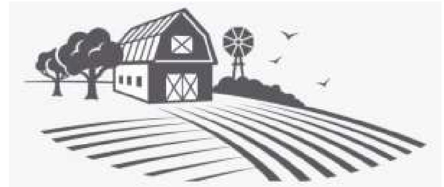
Farmland the root of the community