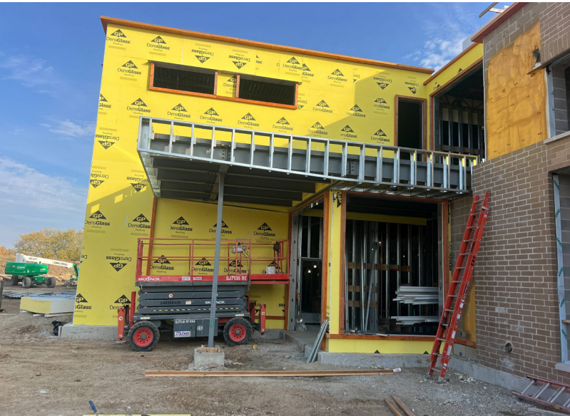
NORTH CANOPY INSTALL PROGRESS