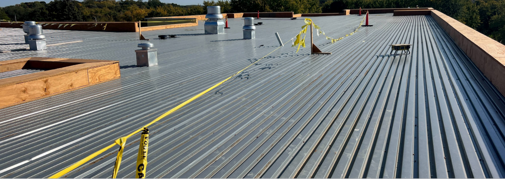
ROOF CLEARED, READY FOR EPDM (RUBBER ROOF) INSTALL