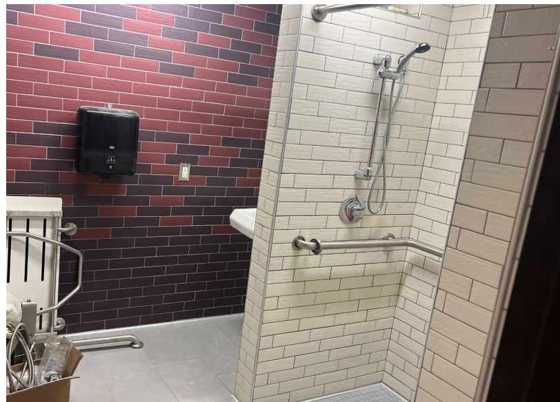
BATHROOM ACCESSORIES INSTALL