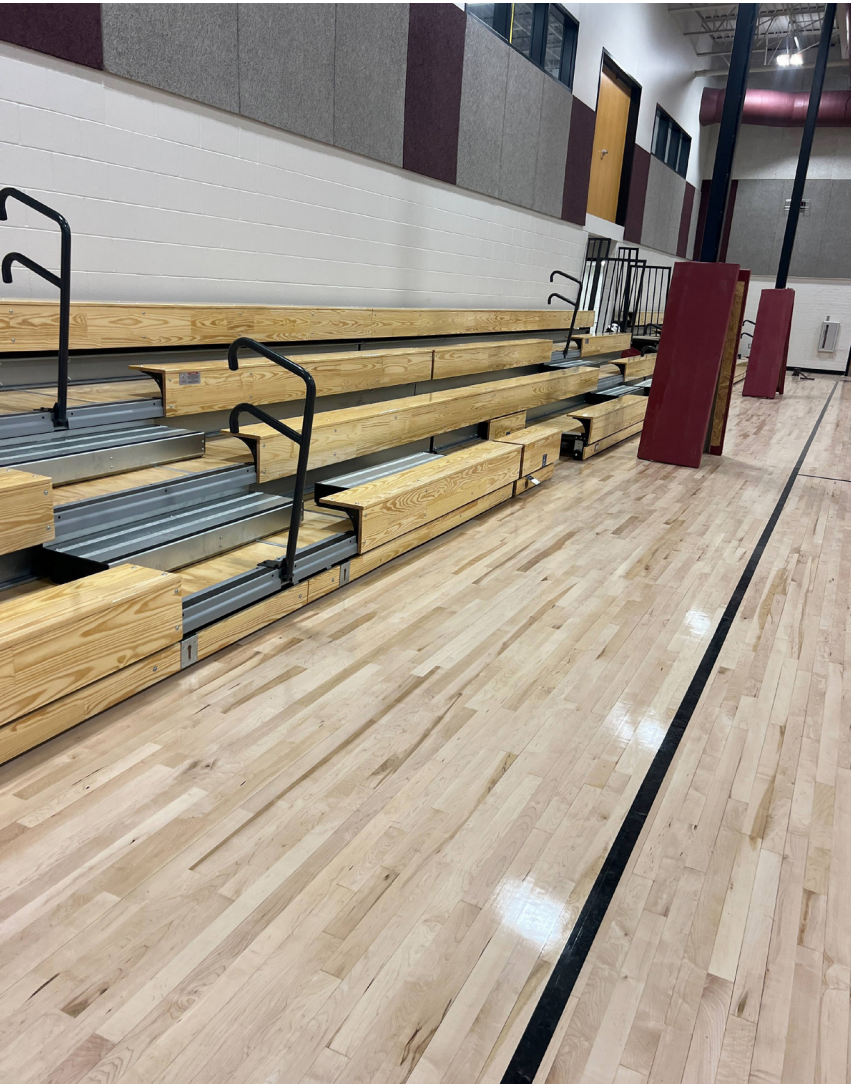
NEW SMALL GYM BLEACHERS