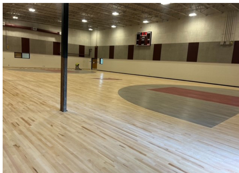
PAINTING COURT MARKINGS IN SMALL GYM