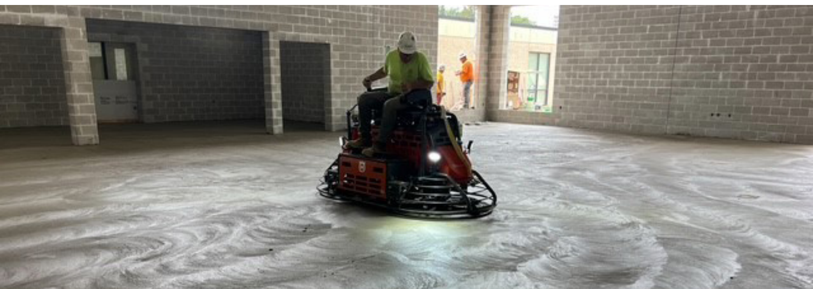
FINISHING SLAB ON GRADE IN UNIT D