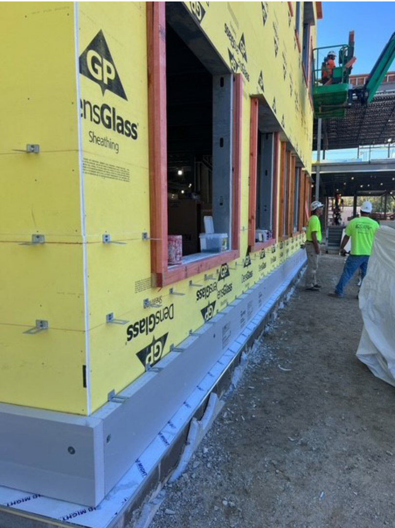
EXTERIOR SHEATHING AND WINDOW BLOCKING