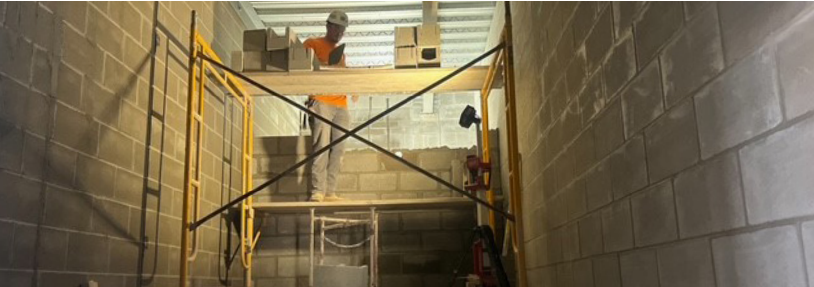
INSTALLING INTERIOR BLOCK WALLS AT UNIT D